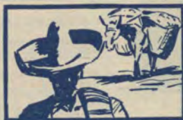
(B) HOUSTON—MEXICO CITY