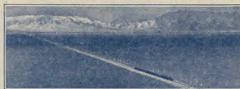
"Going to Sea by Rail" Across Great Salt Lake